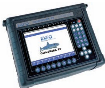
Figure 3 – EXFO's CableSHARK P3

Fortunately, there is a better way to test DSL services. Today, many test sets measure and display the power level of the actual carrier signals. During the qualification phase, it is possible to measure the noise for the channel used by each carrier. The result is 256 individual noise measurements. During the service deployment phase, test sets can display the actual carrier map. In the industry, this is called the bits per bin or carrier load map.