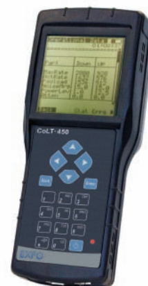
Figure 4 – EXFO's CoLT-450P

EXFO also offers the CoLT-450P. This ADSL, ADSL2, ADSL2+, and RE-ADSL installer's test set displays the actual bits per bin of the actual connection between the test set and the DSLAM. Users can view the display to see if noise and crosstalk are affecting few or many of the carriers. The other advantage of using purpose-built DSL test sets is that the predicted or achieved upstream and downstream connection rates are displayed along with the bits-per-bin display.