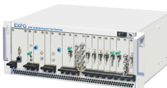
EPX16 Multi-Channel Test System

In 2003, we leveraged our IQS-500 platform to design a new Cable Assembly Test System for multimode patchcord assemblies and added three test modules to our high-performance power meter series. We also introduced the 2.5+ Gigabit Multi-Rate Transceiver for our EPX platforms to help system manufacturers reduce test time and increase test thoroughness on the production floor. This protocol-layer test module simulates and monitors live traffic on each individual channel, enabling customers to carry out critical tests like BER, hybrid concatenation and service-disruption switch time. Subsequent to the year-end, we released the 10+ Gigabit Multi-Rate Transceiver with deep channelization and mixed payload concatenations for next-generation networks. We also launched a tunable external-cavity laser (ECL), whose broad wavelength range is optimized for coarse wavelength-division multiplexing (CWDM) and fiber-to-the-premises (FTTP) testing. These latest innovations point to one undeniable conclusion about EXFO: Innovation lives here!