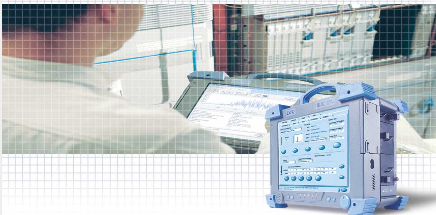
FTB-400 Universal Test System

We have earned our leadership position in the physical-layer NSP market by anticipating customer needs for 18-plus years. When customers encountered problems upgrading their networks to 10 Gb/s, we were first to market with a unique polarization mode dispersion (PMD) analyzer that detected this limiting physical phenomenon. When customers faced test and measurement issues for their dense wavelength-division multiplexing (DWDM) networks, we introduced the best portable optical spectrum analyzer (OSA) and chromatic dispersion (CD) analyzer on the market. With fiber-to-the-home (FTTH) about to become a reality, lead customers are turning to us for another ready-made test solution. These are merely a few examples of the value-added solutions that customers have come to expect from a reliable, long-term partner such as EXFO, but they provide ample evidence of why our customer list reads like a Who's Who in the global NSP market.