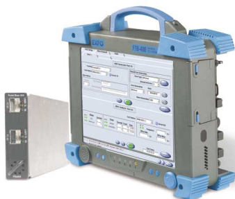
FTB-8515 Packet Blazer™ SAN Test Module