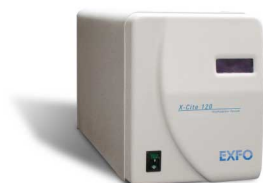
X-Cite™ 120 Fluorescence Illumination System